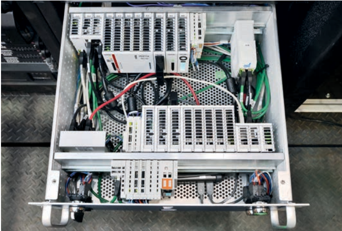
A CX2030 Embedded PC serves as the master controller. This works in concert with additional CX5100 Embedded PCs to provide the necessary computing power across an entire production.