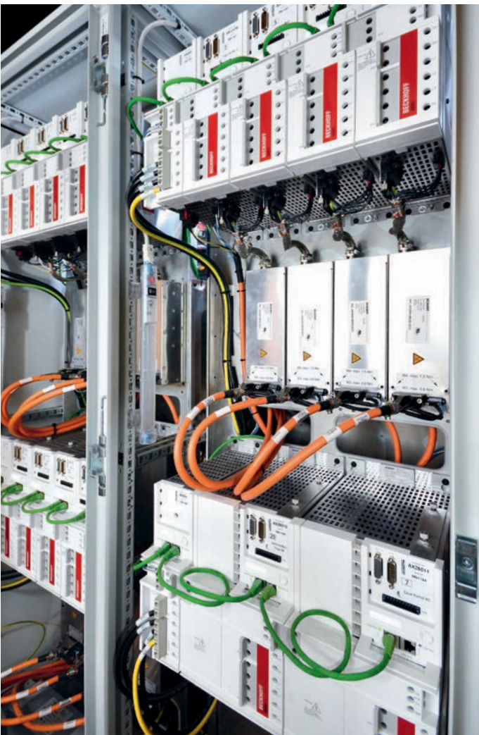
Action and spectacular effects are the heart of any performance: for motion control, Hudson Scenic leverages AX5000 series EtherCAT servo drives and AM8000 series synchronous servomotors with OCT.

controllers allows us to choose the right performance level for the job, and it helps mitigate cost for the shows and for customers." When larger screens are required, the Hudson-programmed HMI is displayed on a series of 15-inch Beckhoff CP2916 multi-touch Control Panels.