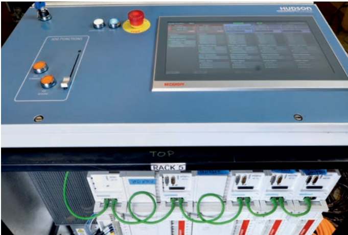
Displaying the HMI programmed by Hudson is a series of 15-inch Beckhoff CP2916 multi-touch Control Panels.