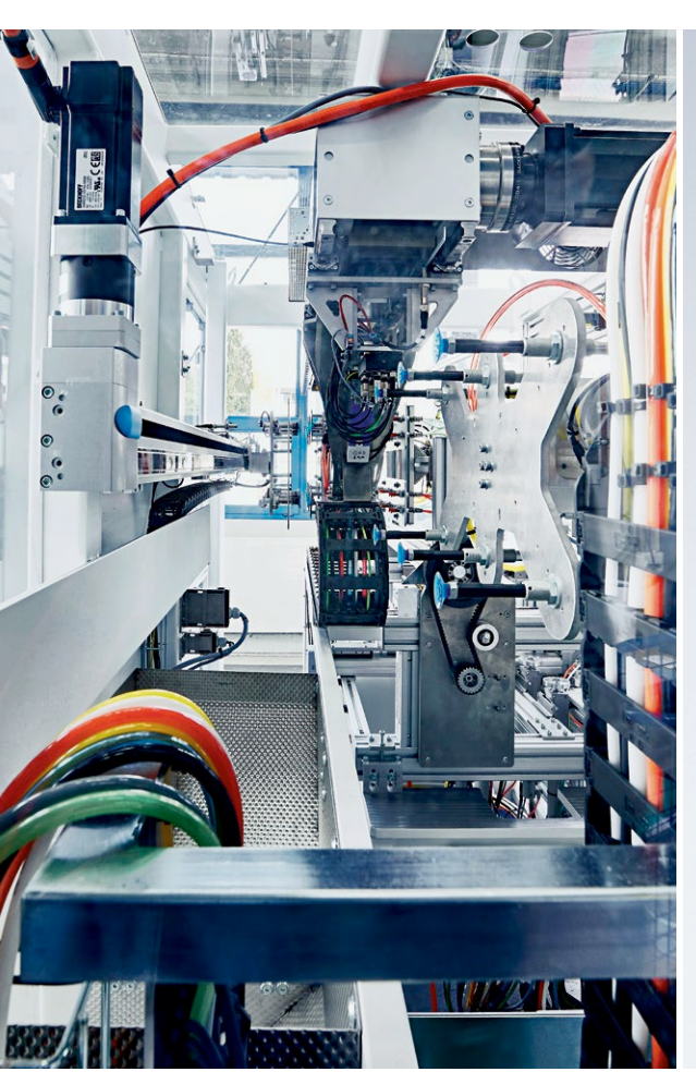
Two of the machine's four AM8000 servomotors move the main arm (motor on the right) and the shuttle (motor on the left).