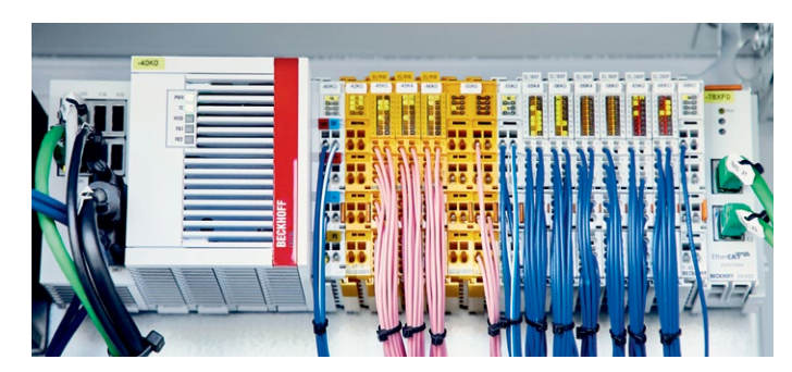
The CX5130 Embedded PC and the I/O level with EtherCAT and TwinSAFE terminals are extremely compact.

inspection system with a sufficiently short cycle time, says Nino Zehnder. In addition, the servo drive technology is much less jerky than pneumatics, which increases the machine's durability due to the reduced inertia forces. The other servo axes are used to take the labels from the magazine and to stack the finished lids. Another positive feature is the One Cable Technology (OCT) from Beckhoff, says Christoph Jenni: "OCT reduces the wiring and assembly effort significantly. And the electronic type plate makes it much easier to commission, troubleshoot and possibly replace devices."