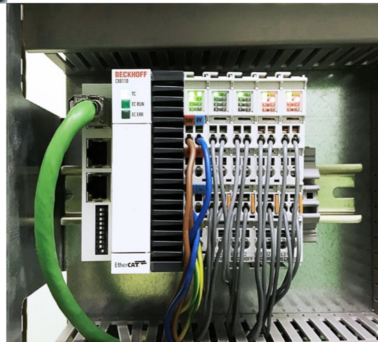
Beckhoff CX8110 Embedded PC with EL3182 analog EtherCAT input terminals for HART-capable field devices

Process analytical technology (PAT) plays a crucial role in the chemical industry. Bayer AG, for example, is enhancing efficiency and transitioning from time-based to condition-based maintenance by embracing the cutting-edge NOA concept. This is implemented through the seamless integration of a compact edge device featuring a CX8110 Embedded PC, EL3182 EtherCAT HART Terminals, and Beckhoff's TwinCAT OPC UA Server, without any alterations to the existing control technology.