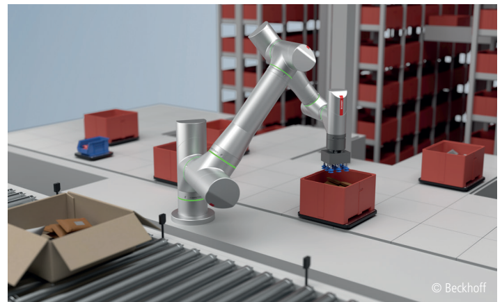
The modular industrial robot system ATRO simplifies handling in intralogistics and production

that limit the reach of the robot arm. Perhaps the greatest advantage of the ATRO system is that it is fully integrated into the TwinCAT control architecture, meaning no separate robot controller is required. The mobile robot controller from Beckhoff also handles the ATRO kinematics. ATRO is opening up new possibilities for mobile robots with added robot arms, providing the flexibility required by many end users in retail and parcel delivery services.