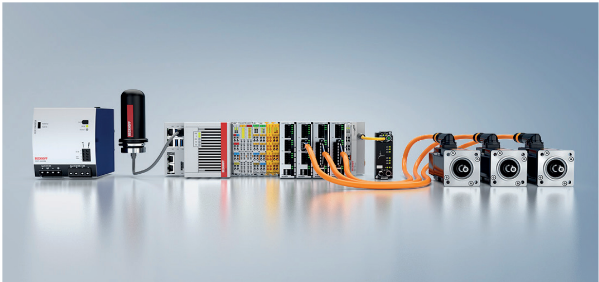
The modular range of components from Beckhoff provides a clear competitive advantage in the automation of AGVs and AMRs.

Beckhoff implements open automation systems using tried-and-tested PC-based control technology. The main areas that the product range covers are industrial PCs, I/O and fieldbus components, drive technology, automation software, control cabinet-free automation, and hardware for machine vision. EtherCAT as a real-time Ethernet fieldbus ensures high-performance communication.