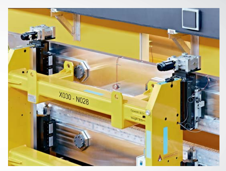
A total of four AM3052 servomotors per undulator cell – controlled via TwinCAT NC PTP – ensure that the magnet structures are precisely positioned. (The image shows the two motors of the upper magnet structure)