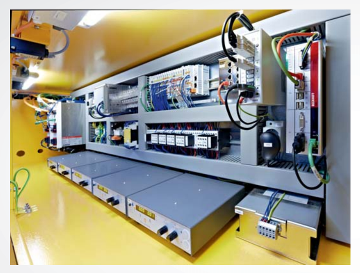
Each of the 91 undulator cells is controlled via PC-based control. The system features a C6925 control cabinet PC (right), numerous EtherCAT Terminals (center), and two AX5206 Servo Drives (left).

The high-performance TwinCAT software with integrated Motion Control functions offers a wealth of benefits, as Dr. Suren Karabekyan explains: "TwinCAT enables the implementation of a high-precision, very dynamic drive control