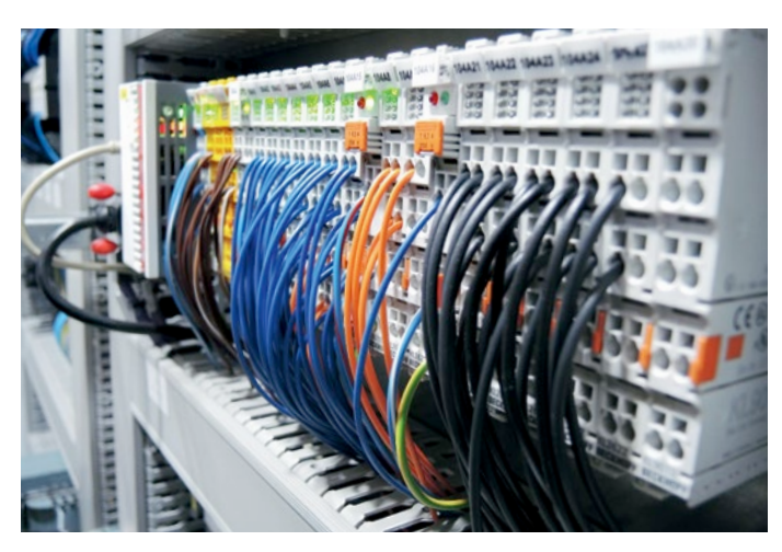
The modularity of the Beckhoff terminal system allows subsequent changes and additions at any time and little cost.