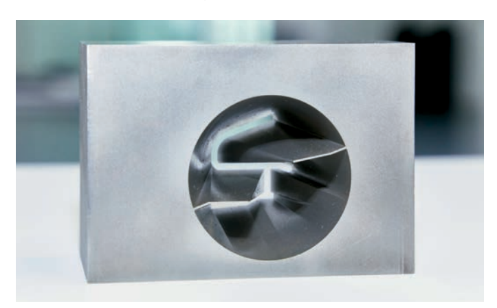
Wire EDM (electrical discharge machining) can be used to produce complex geometries.

CNC, we change the tool-radius compensation dynamically. All this is realized through four TcCOM modules as interfaces to the CNC kernel: wire bending correction, dynamic tool-radius compensation, corner pre-control and surface speed regulation.