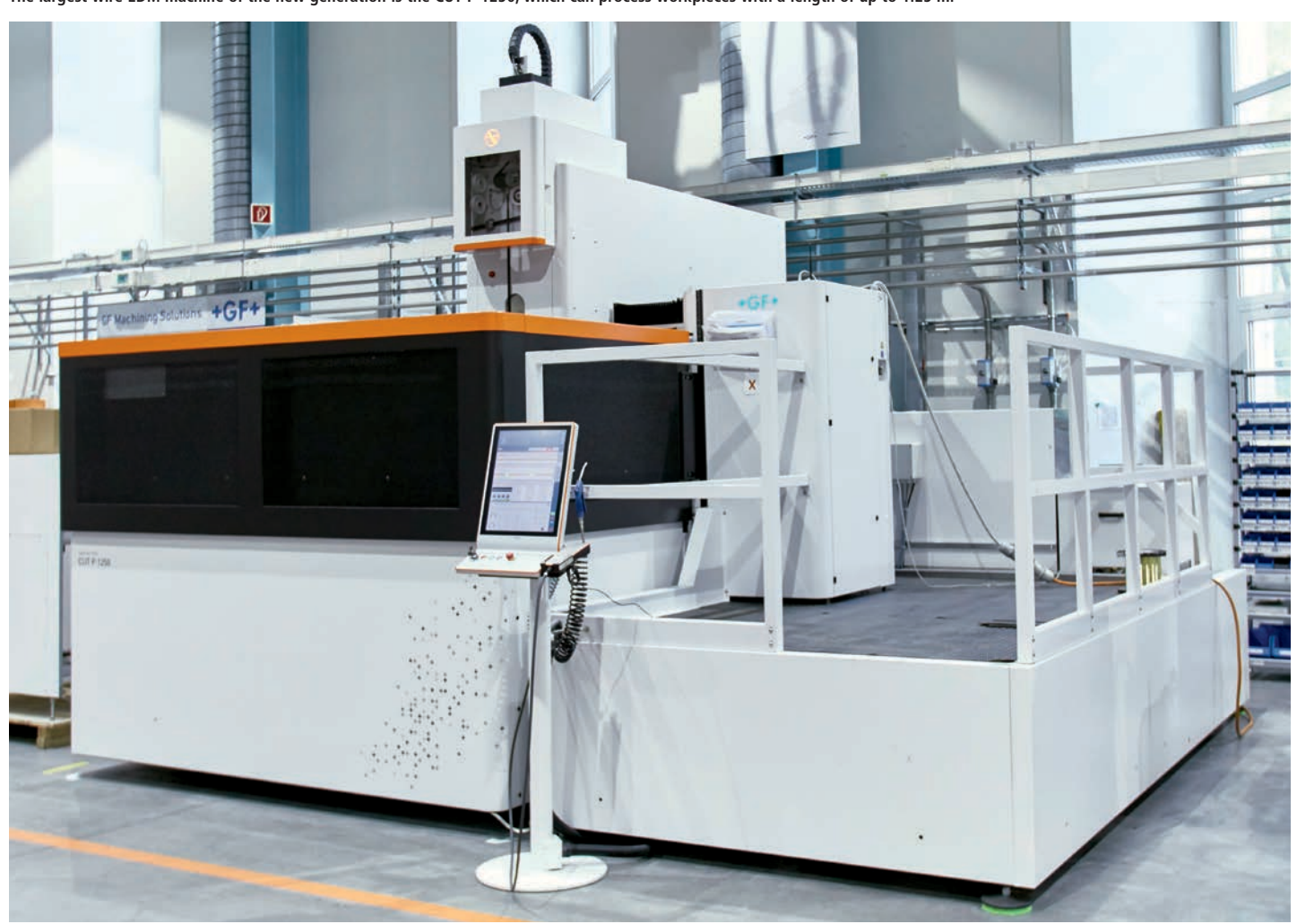
The largest wire EDM machine of the new generation is the CUT P 1250, which can process workpieces with a length of up to 1.25 m.