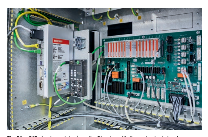
The EtherCAT plug-in modules from the EJ series with the customized signal distribution board (on the right), as well as the C6920 control cabinet IPC and the EP6224 IO-Link module with IP 67 protection.