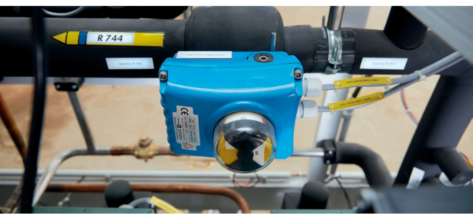
The valve that switches the compound CO<sub>2</sub> refrigeration system from normal cooling to deep-freeze operation.

Stefan Bollmann, who works in project planning and sales at Tekloth, believes there are many good reasons for implementing the complex sequence control with PC-based control technology: "We benefit from the ability of Beckhoff control technology to meet industrial requirements in all our projects. In addition, the systems' modular structure and open programming environment make them very flexible and enable an exceptional degree of innovation. As a result, we were able to program the sophisticated controls for this compound refrigeration system ourselves, which allowed us to maintain total control of the