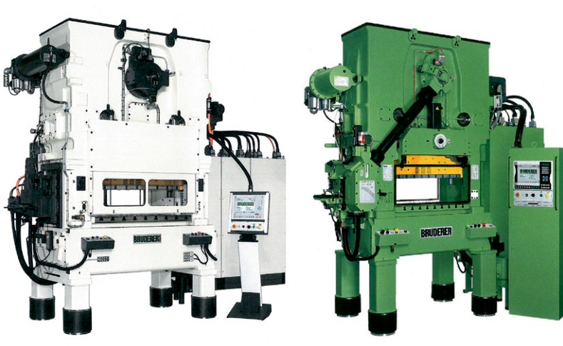
A recent stamping machine in the BSTA series (BSTA 810, left) and the first BSTA 500 stamping machine supplied with a Beckhoff control system in 1999 (right)

Schaffhausen as well as in the Arbon branch office. And this is the case at a professional and personal level, both with the Swiss experts and for more specialized requests with the product developers in Germany. When challenges arise, as can frequently happen over the course of machine development, we never feel that we are left to our own devices by the Beckhoff experts. The same is true when it comes to implementing specific requirements. Apart from the already very broad portfolio, we have never needed much persuasion to get Beckhoff started on developing or adapting a product. Especially considering such products, which may frequently be suitable for other purposes than ours, Beckhoff benefits from our industry and machine expertise too.